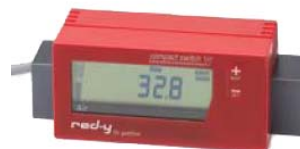
SMART METER & PC

The free 'get red-y' software runs on any PC with a Windows operating system.