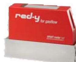
SMART METER GSM

The high precision and tight sealing of thermal mass flow rate meters is remarkable.