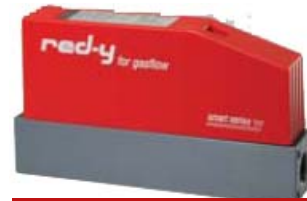
SMART CONTROLLER GSC

These mass flow controllers feature high accuracy and rapid regulation.